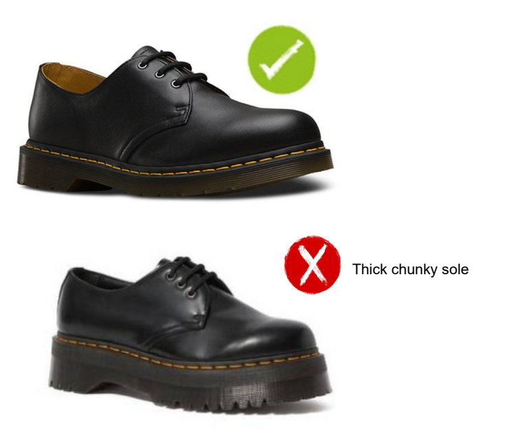
Year 2 to Year 12

"Doc Marten" style shoes must have the yellow stitching covered with a black permanent market pen and the sole must be as pictured.